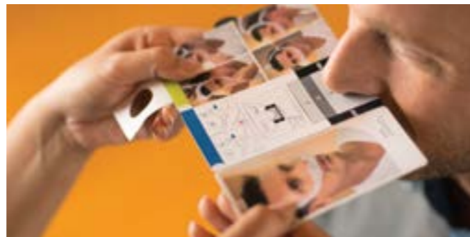
DreamWear cushion size is determined by measuring the length and width of the nose with the simple sizing gauge.***

Users told us that DreamWear gave them more freedom to move, had a better fit than their prescribed mask, and comes closest to making them feel like they don't have anything on their face during therapy.*