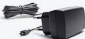
VELOX® AC power supply (EU)