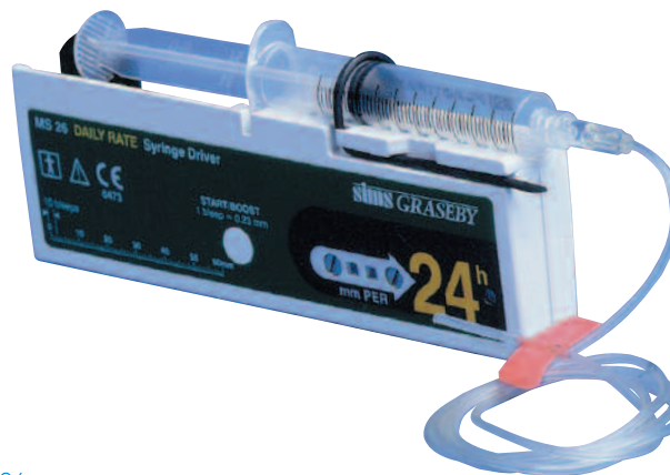
MS26 Syringe Driver rate set in mm/day