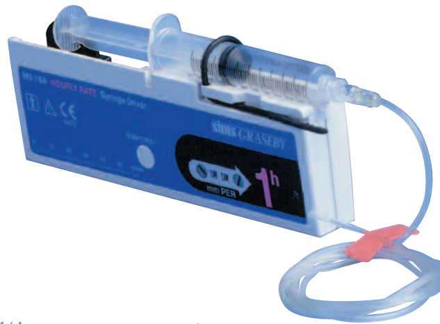
MS16A Syringe Driver rate set in mm/hr