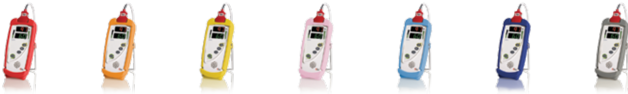
Protective boots are available in your choice of seven different colors.