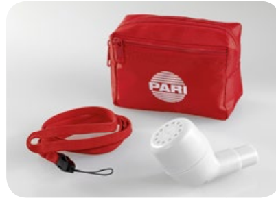
Item No. 018G5000